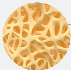
COMPOSITION OF BONE